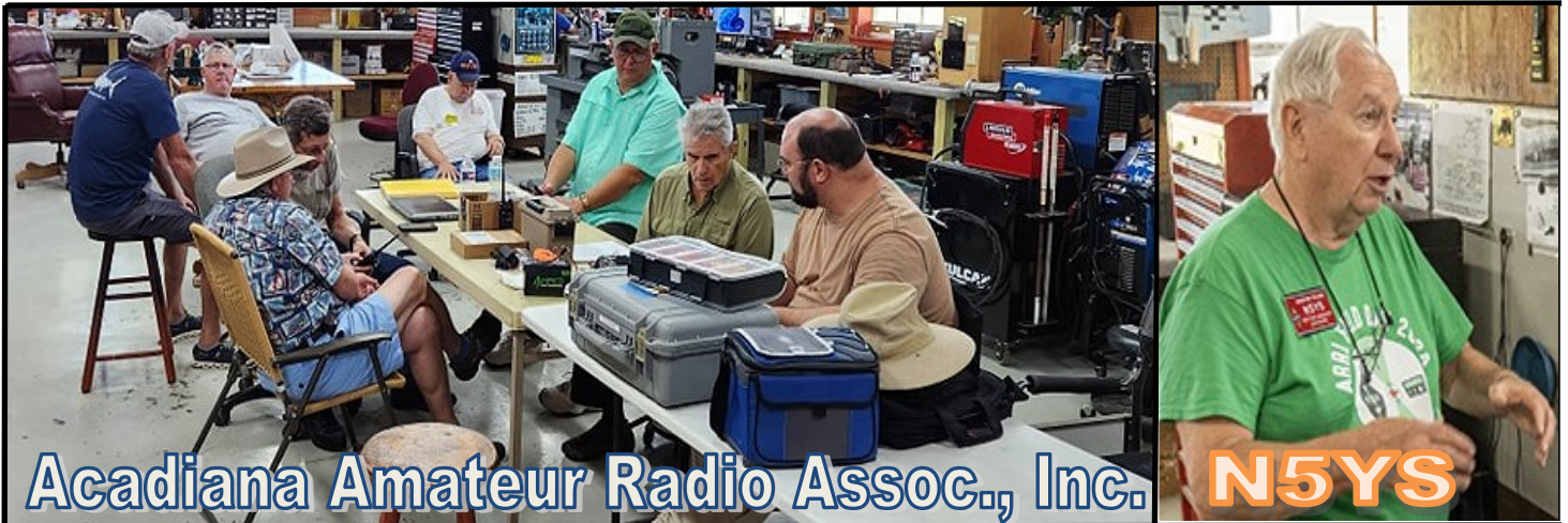
Acadiana Amateur Radio Assoc., Inc.