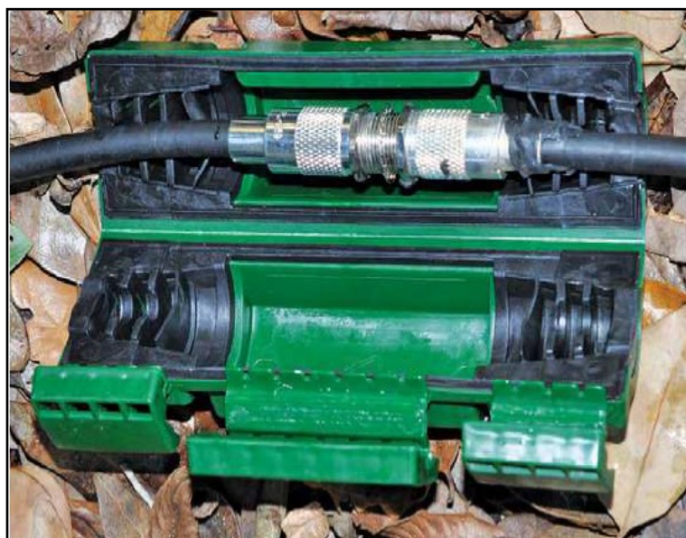
Figure 6 — A Cord Protect shield is being used to protect a feed-line splice consisting of two PL-259 connectors and an SO-239 bulkhead.

You'll find Cord Protect shields online and in home goods stores. They are inexpensive and easy to remove, and they allow for quick access to connections without the need to cut through layers of tape. — 73, W. Derek