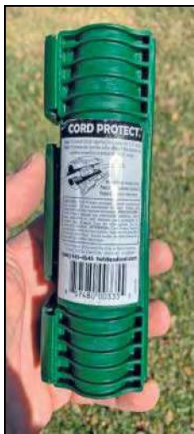
Figure 5 — Cord Protect offers a water-resistant solution for outdoor wiring.

One solution can be to entirely replace the feed line, but if the replacement length is considerable (and if you are using low-loss coax), the cost can be substantial. A less expensive option is to repair the cable by cutting out the damaged portion and joining the remaining ends with a couple of male connectors and a dual-female bulkhead. For example, you might join two PL-259 connectors with an SO-239 bulkhead. But how do you make this connection water resistant? Wrapping the connection with selffusing silicone tape would work, but if you ever need to access the connection, you'll find that removing the tape can be challenging work.