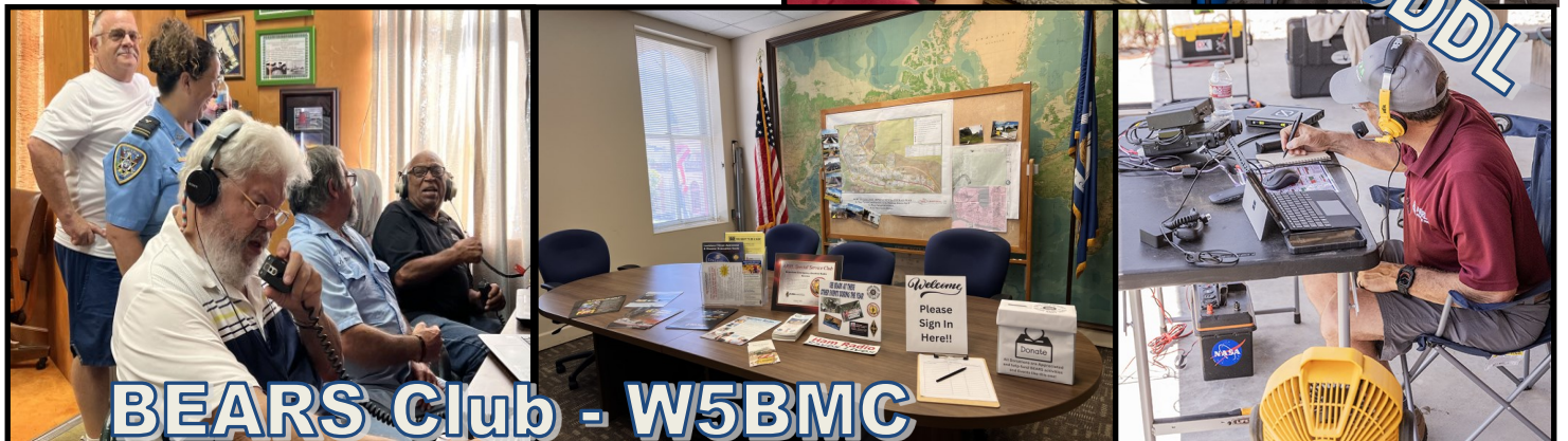
BEARS Club - W5BMC